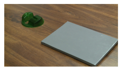
An ATM card reading device (left) and camera to capture pin numbers (right).